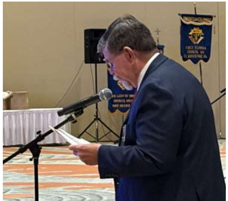
DD George Elliott addressing State Council